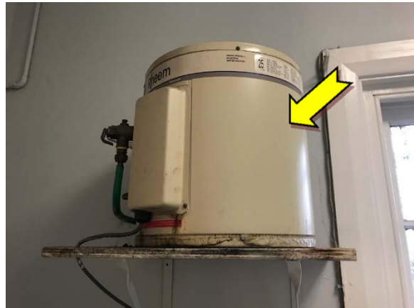
Photo 4. Interior, kitchen, hot water heater – suspected SMF internal insulation material.