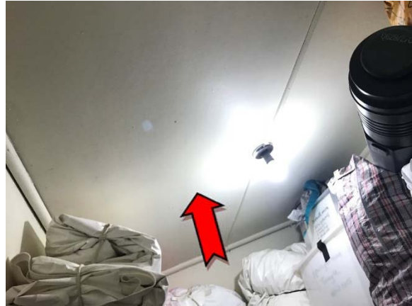
Photo 2. Interior, throughout, store cupboard, ceiling – asbestos-containing fibre cement sheeting.