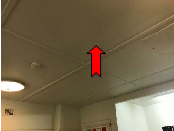
Photo 1. Interior, throughout, ceiling – asbestos-containing fibre cement sheeting.