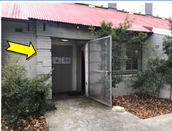
Photo 5. Exterior, throughout, walls – suspected lead-containing grey upper paint systems.