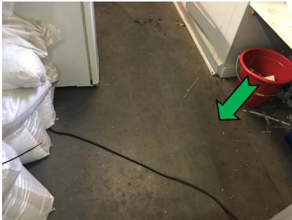
Photo 3. Interior, kitchen, floor coverings – non asbestos-containing sheet vinyl.